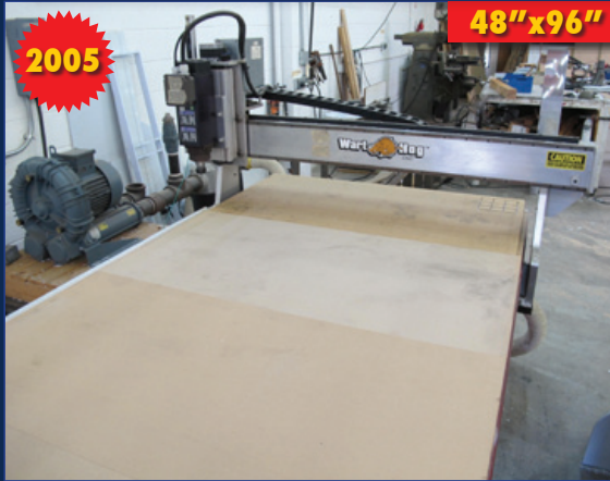
WART HOG SX 100 CNC ROUTER

INSPECTION: MORNING OF SALE FROM 8:00 AM TO 11:00 AM PDT